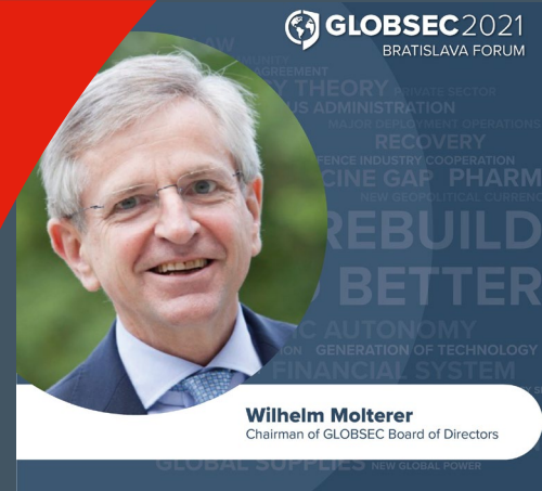
Wilhelm Molterer Chairman of GLOBSEC Board of Directors